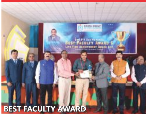
BEST FACULTY AWARD